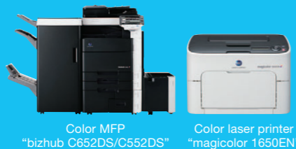
Color MFP "bizhub C652DS/C552DS" Color laser printer "magicolor 1650EN"

With advances in digital network technology, MFPs (Multi-functional peripherals), printers, and other office equipment are being relied upon more and more as critical infrastructure for daily office work. Products in Konica Minolta's MFP bizhub series are equipped with various functions that help customers improve work efficiency, cut costs, reduce environmental impacts, strengthen security, and resolve other issues in office management.