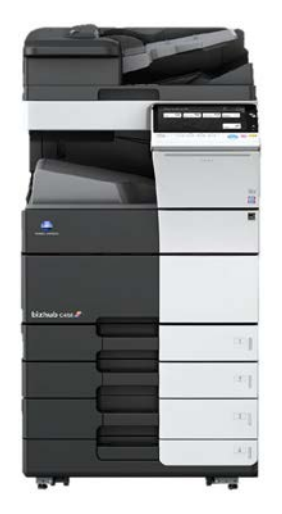
Total of 1,215,000 sheets on the assumption of five years usage. Environmental impact by copypaper is not included.

Please direct any inquiries or comments to e-mail: bt-environ@pub.konicaminolta.jp