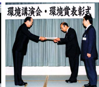
Ceremony for the Konica Minolta Environmental Award. Awardees are recognized from among Konica Minolta employees around the world; seven prizes were awarded in 2003.

chasing Network (GPN)" since its inception, and conduct green procurement for a wide range of items, including office supplies, office and computer equipment, toilet paper, vehicles and forklifts, as well as the paper and ink that we use for company pamphlets and other publications.