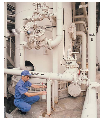
Sampling water at a waste water treatment facility

Environmental laws and regulations are of two main types, those covering factory operations and those related to products; our ISO 14001 system ensures that we comply with both. We have established a system for the entire Konica Minolta Group to share the latest information on legal requirements regarding business operations, and to check that those regulations are properly enforced. We also double-check our compliance through sharing information in a cross-cutting way among all of our manufacturing companies.