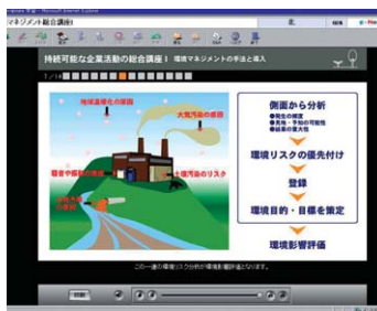
On-line environmental education developed by Konica Minolta Business Solutions Japan Co., Ltd.

We conduct training for all of our employees, including temporary staff, to ensure that we achieve our environmental goals. We conduct graduated training programs, including through Konica Minolta College. We conduct other activities to raise awareness of environmental issues, including an environmental seminar series by outside experts, and the Konica Minolta Environmental Award.