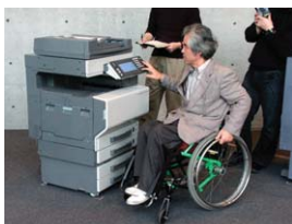
Angle-adjustable control panel for people viewing from a low angle