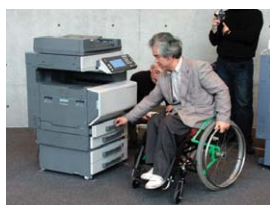
Paper tray can be easily held from either a sitting or standing position

Universal design assessment is conducted repeatedly by having users operate the equipment, after which we then make fine adjustments to improve product handling. The end-results are products that are easier to operate (see below).