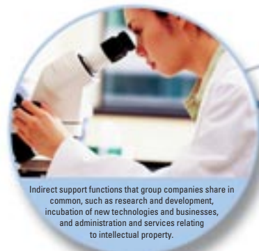
Indirect support functions that group companies share in common, such as research and development, incubation of new technologies and businesses, and administration and services relating to intellectual property.

* The message represents our wish to be acknowledged as an essential company, by offering essential products, services and solutions to customers in the world of imaging.