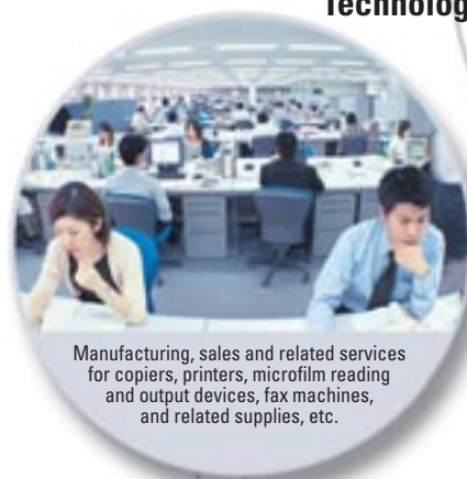
Manufacturing, sales and related services for copiers, printers, microfilm reading and output devices, fax machines, and related supplies, etc.