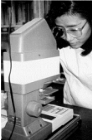
Measurement by Colorimeter

Resins used as restorative materials for dental treatment to fill drilled teeth or cap ground teeth have made remarkable progress in recent years. However, the problem that the surface of the resin is easily stained by tobacco or food has still not been solved. Because of this, this college laboratory conducts research on improving the resin surface condition. To improve the resistance of the resin to pigmentary deposits, attention is being paid to surface treatment agents which improve the water repellency and the possibility of using various surface treatment agents is investigated. For this investigation, the color of the sample requires quantification with a colorimeter which can measure the samples (10mm) accurately and provide numerical data. Surface treatment agents are also receiving attention for use on industrial parts.