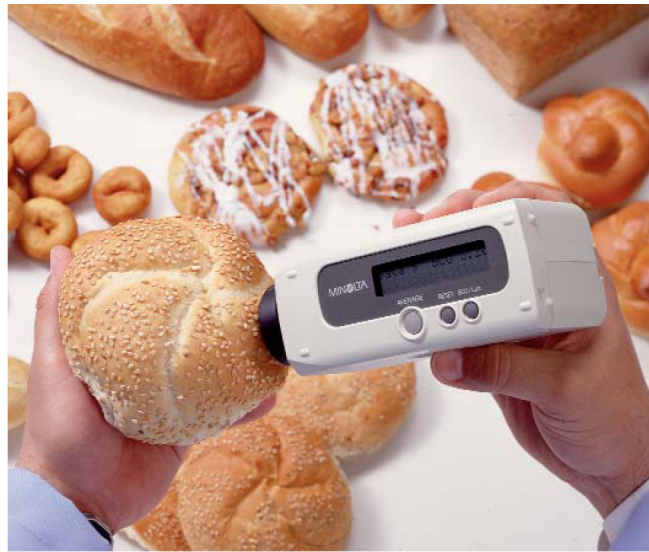
BC-10 Baking Contrast Meter

Visual color judgement was simply too subjective. At Pepperidge Farm it was recognized that consistent color and appearance are so important to consumer preference and to the flavor profile of baked and fried products