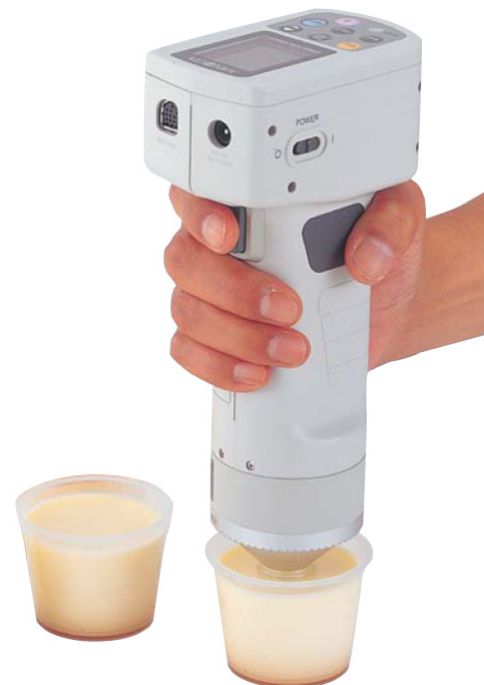
Sample measurement of custards, yogurts, puddings, jellies, jams

Experimenting with portable and bench top spectrophotometers, the laboratory found that it could work backward from the ideal final product and establish specifications and tolerances for color at each stage of the product manufacturing process. Color variations from standard could then be adjusted to better assure color consistency in final products. Welch’s also found spectrophotometry highly useful in new product development.