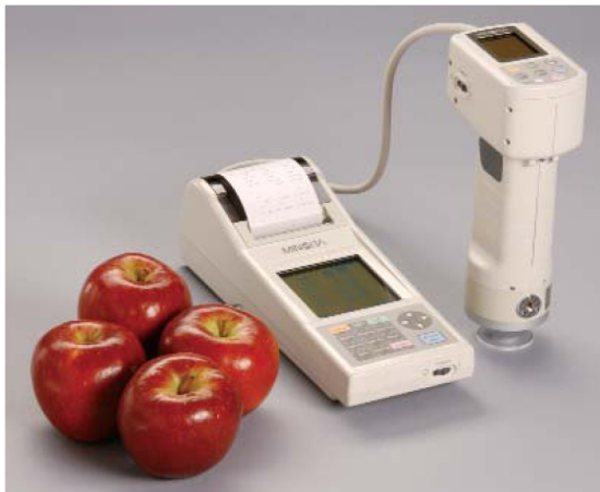
CR-400 Series Colorimeter

In current food industries’ practice, two principal color measurement techniques are used: Colorimetry and Spectrophotometry.