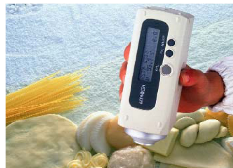
CR-14 Whiteness Meter

The solution was first standardizing an ideal semolina flour using a Konica Minolta Colorimeter System, and then measuring individual flour lots for their color characteristics. By sample averaging, color variability within each lot was reduced, and then computer color matching of lots for successful color mixture potential in a final flour blend became possible.