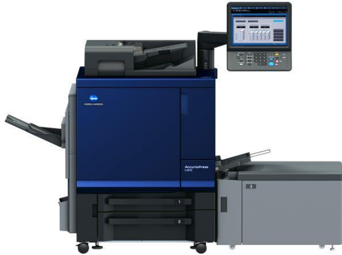
Photo:Option-unit is mounted