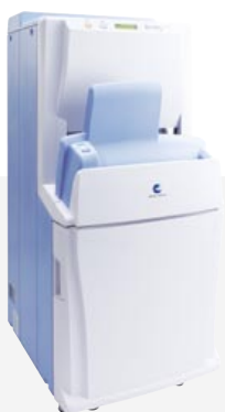
Digital X-Ray Image Reader REGIUS MODEL 210