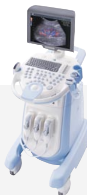
Color Diagnostic Ultrasound System SONIMAGE 513