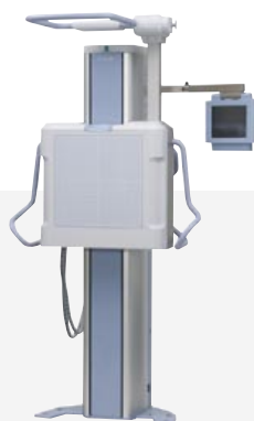
Digital Radiography PLAUDR C30