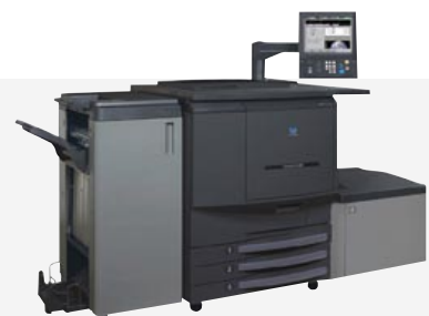
On-demand Printing System Pagemaster Pro 6500N