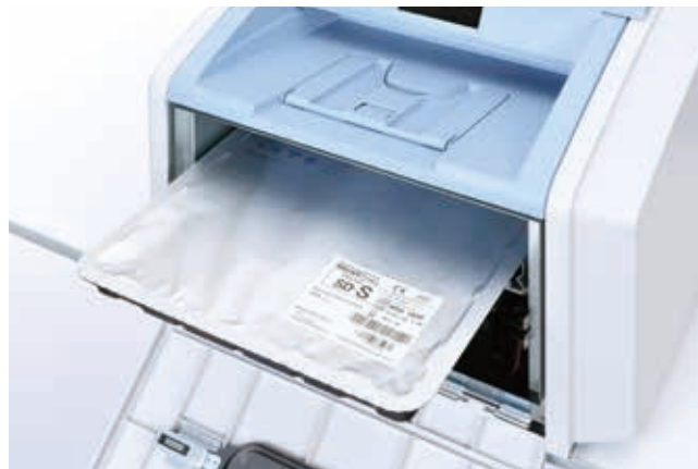
SD-S Film Cartridge

SD-S is specially designed for the Laser Imager DRYPRO SIGMA.