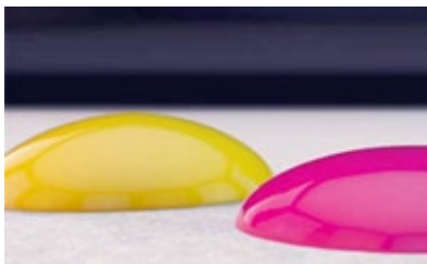
Ink turned into gel

The AccurioJet 30000 uses Dot Freeze Technology* 2 using Konica Minolta's proprietary HS-UV ink, which has been highly evaluated for the AccurioJet KM-1/KM-1e series. The technology significantly reduces the dot shape distortion and color blurring compared to water-based inkjet. It also enables direct printing on various types of paper without special precoating, including glossy or uneven paper and plastic media without impairing the quality or texture of the printing media surface. The HS-UV inkjet does not cause waviness and curling of paper because it does not require the thermal fixing and drying processes.