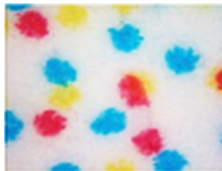
Significant reduction in distortion and color blurring