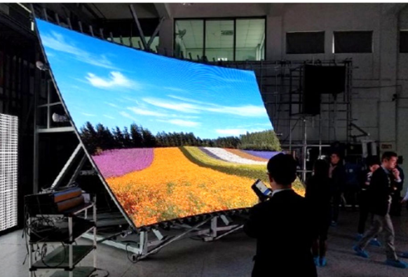
Panel of the LED dome system in part

Characterized by higher luminance and wider color gamut, the system can reproduce highly realistic and beautiful starry skies of unprecedented quality.