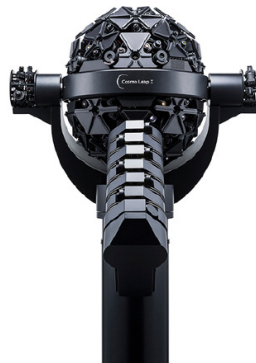
Planetarium projector “Cosmo Leap \Sigma ”