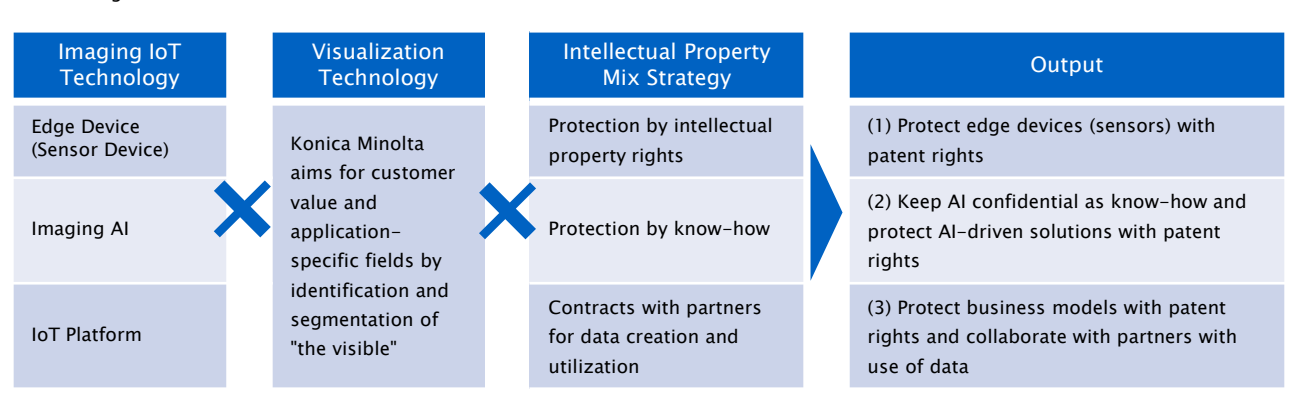
Fig3. Diagram of genre-top strategy for imaging-IoT intellectual property

For the Intelligent Quality Optimizer Unit IQ-501 that we launched in the summer of 2017, we have strengthened our patent portfolios globally and built an intellectual property genre-top position. As a result of these efforts to build our patent portfolios, products equipped with Intelligent Quality Optimizer Unit functionality have secured the highest share in their target markets. The portfolios are also helping to secure a high profit ratio.