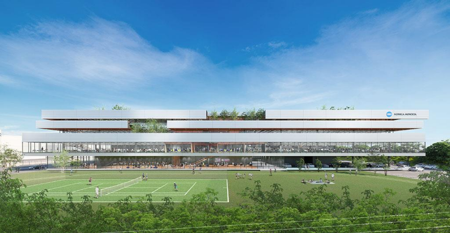
Rendering of Innovation Garden OSAKA Center (to be constructed in 2020)

The development of imaging IoT that utilizes imaging AI and high-speed processing technology, which are Konica Minolta's strengths, will drive the growth of the company's global IoT business and data business. Konica Minolta will promote the full-scale development of these technologies to strengthen its development capabilities.